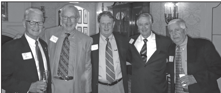
This year's Golden Legion Ceremony was a huge success. Alumni gathered with 40 undergraduates to celebrate the 50th Anniversary of the pledge class of 1967 and Georgia Alpha's Harvard Trophy win. To view an online photo gallery, visit gaalpha.com . More details inside!