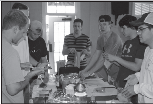
One of the many community service projects this year included partnering with Athens PB&J and the Backpack Project to make backpacks and sandwiches for the homeless community in Athens.