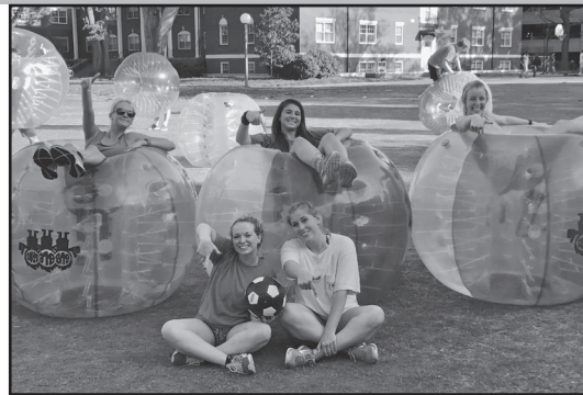
During the second annual Master's themed philanthropy week, brothers held a Bubble Soccer Tournament. The growing popularity of this event makes it a must-have every year!