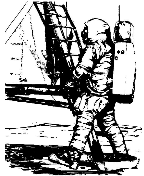
A sketch of the first historic step on the moon provided by NASA for The Scroll .