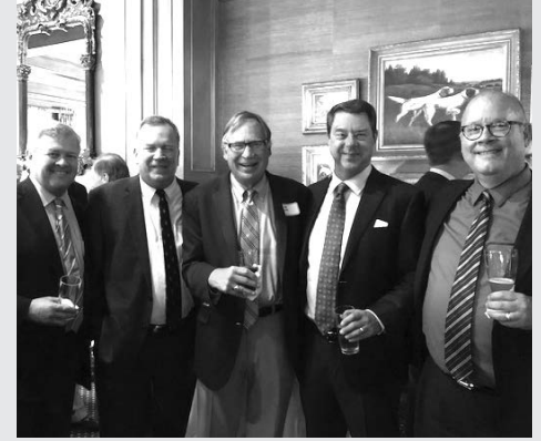
Georgia Alpha alumni celebrate the Golden Legion honorees and Founders Day.