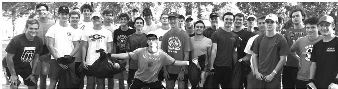
Phikeia support the Athens community by cleaning Fourth Street after the first home football game of the season.